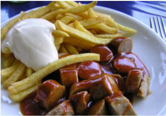
"Pommes Currywurst Mayo": along with "Pommes Schranke" (with mayonnaise and ketchup), one of the Ruhr classics.

Due to the horrible potato harvest last year, the prices for industrial potatoes have almost tripled in comparison to the year before. French fries will become more expensive.